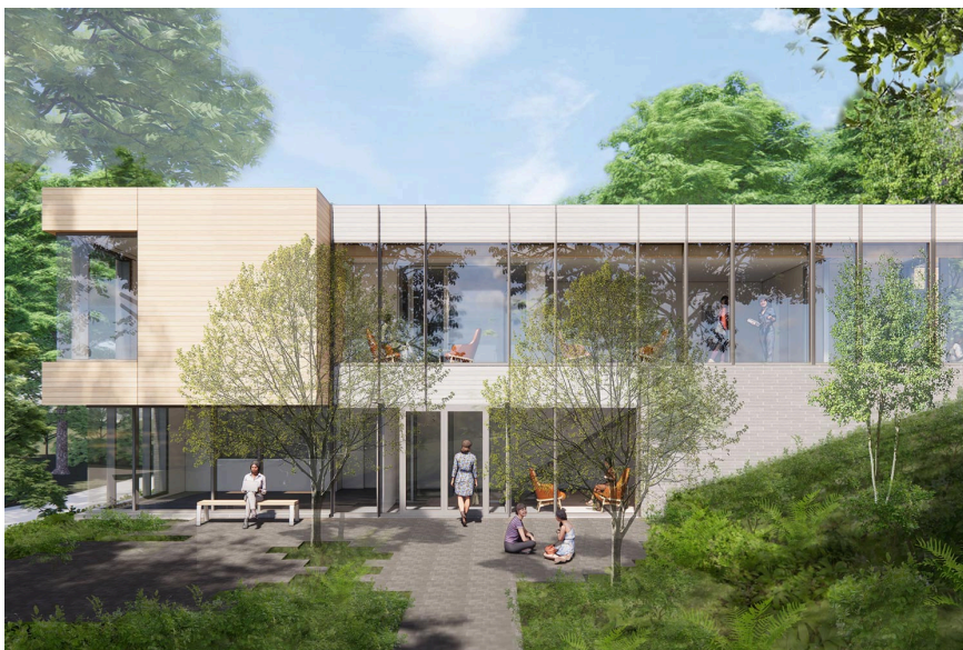
Wellesley College Health Center- Wellesley, MA, USA