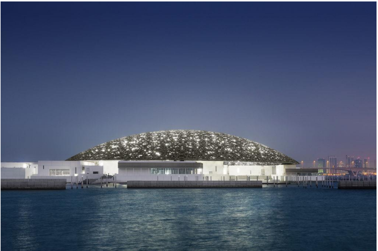
Louvre Abu Dhabi

'It is refreshing to actually work on something tangible and have key responsibilities. It is really inspiring to be involved in the design for all these fascinating buildings that later I could show and say, I helped to make this'.