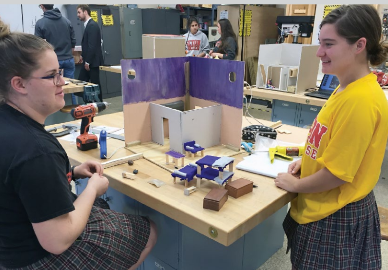
ESHS STUDENTS BUILDING THEIR MODEL HOUSE.

Milke, meanwhile, is working with Scheer, now a student in FPE’s Master of Engineering program, on translating the FPE Design Challenge into a 100-level undergraduate engineering course.